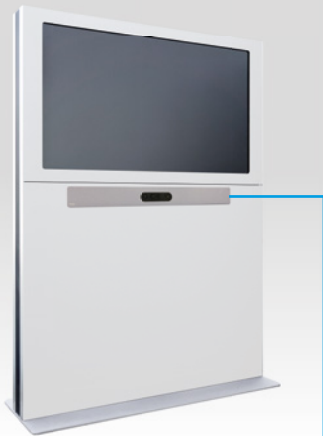
Integration of video conferencing room kits

Automatically retractable webcam (completely foldaway when retracted)